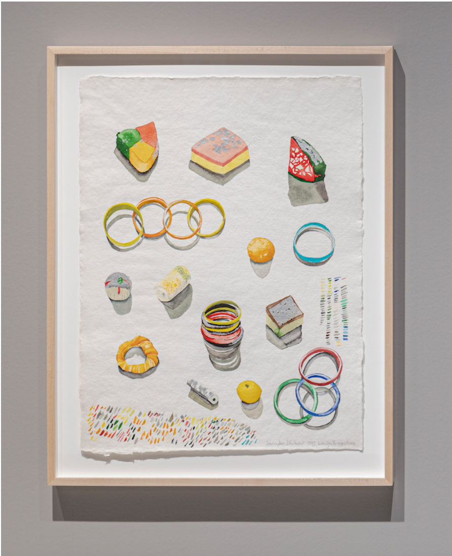
Sarindar Dhaliwal Bangles & Sweeties, 1979 Watercolour on paper