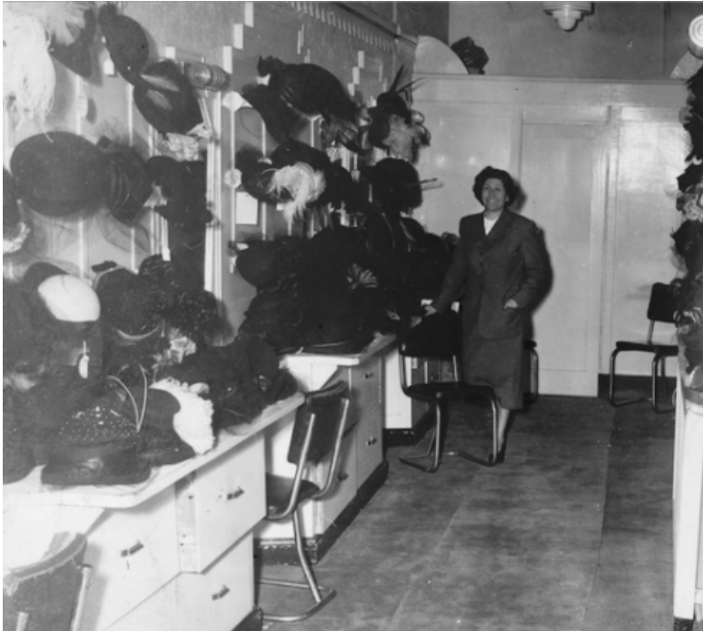
Interior View of Minette Millinery, 278 ½ Yonge St., Toronto, c. 1935-1945